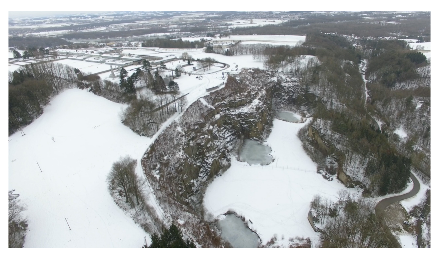
Figure 3: Mauthausen Concentration Camp in winter 2017, with quarry in foreground.

"Contemporary architecture tends to produce objects while its real role should be that of generating processes. This distortion has very serious consequences for it confines architecture to a very narrow strip of a whole spectrum, so segregating it, leaving it open to the risks of dependency and megalomania, and leading it to social and political indifference." <sup>17</sup>