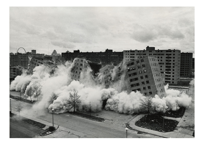
Figure 1: Pruitt-Igoe, July 15, 1972.

When Jencks and his contemporaries named the end of modernism, it was during a reflective moment where the promises that modernism offered of social change and uplift remained unfulfilled. The 1970s were challenging times—an economic downturn, an energy crisis, global unrest after 1968, and a hangover from public projects viewed as violent disasters.<sup>3</sup> Architects and planners came under attack for this violence and their relationships to power.<sup>4</sup> And many architects distanced themselves from the architecture that espoused an ambition for social change, what architect Denise Scott Brown labeled the "unthinking, authoritarian and socially coercive stance taken by Modern architects in the 1950s and 1960s."<sup>5</sup>